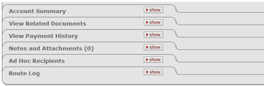
Figure 1 – PURAP tabs

Notes and Attachments, Ad Hoc Recipients, and Route Log tabs are covered in the Basics tutorials.