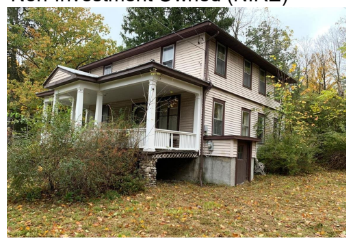
Non-Investment Owned (NIRE)