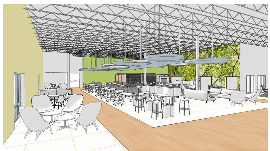
Renovation of Cornell Administrative Suites New anchor tenants; support for flexible work