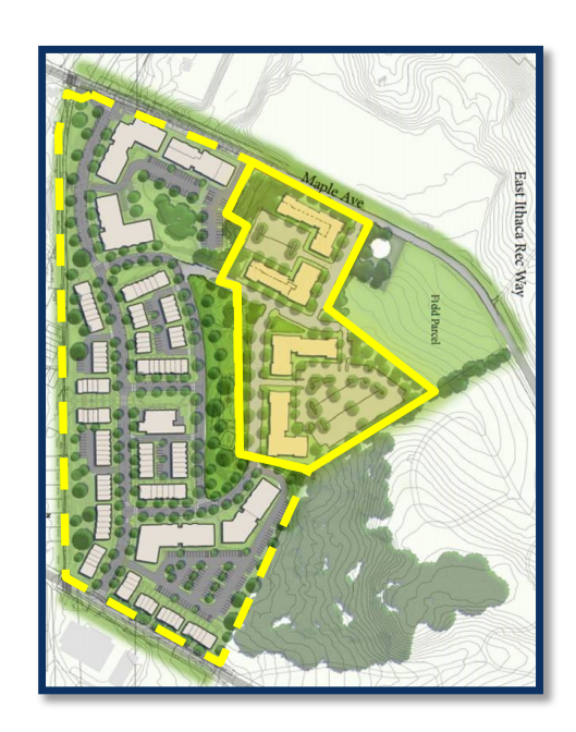
Potential 2<sup>nd</sup>/Additional Phase Adjacent Cornell-owned land