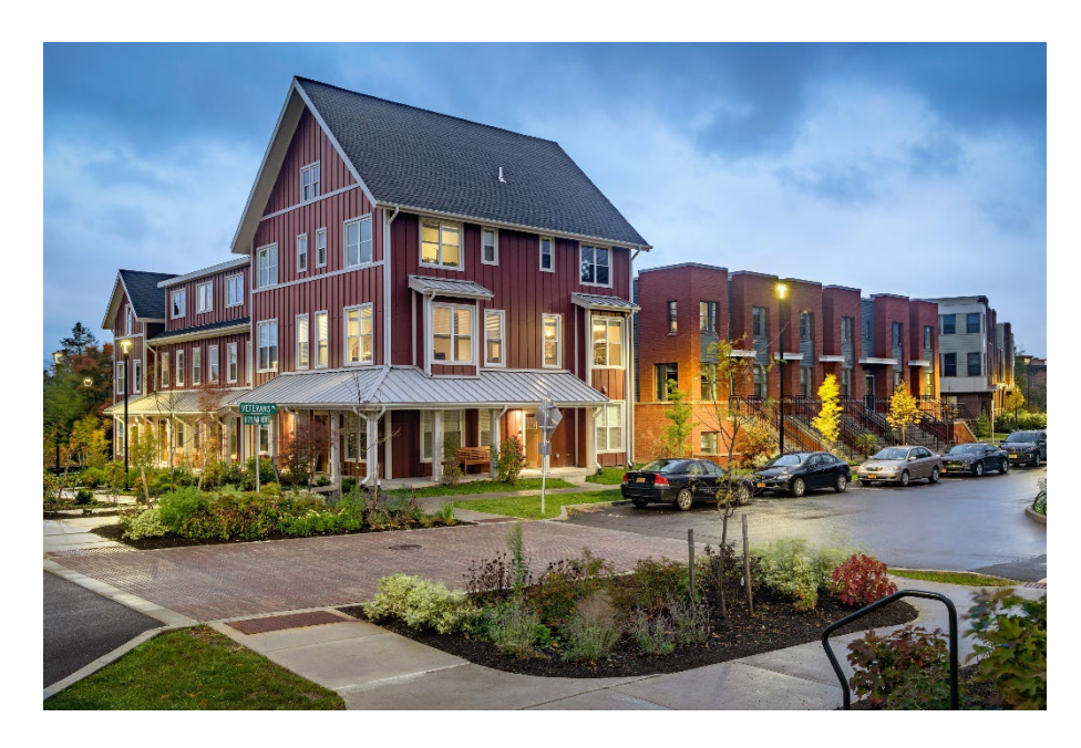
Maplewood Existing site, Greystar (Cornell Land)

P3 Support: Graduate Housing Strategy (with Asset Management, SCL)