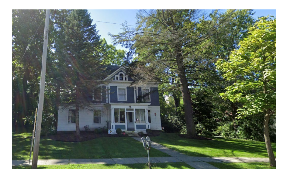
401 Thurston: partnership, Center for International Studies