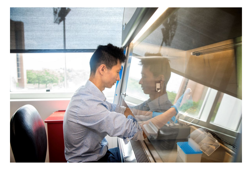
Langmuir Labs (Business & Tech Park) Lab/office renovation to support university business incubator graduates